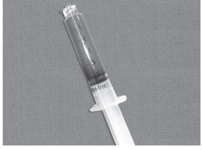
Fig. 1: Colour of arterial blood sample